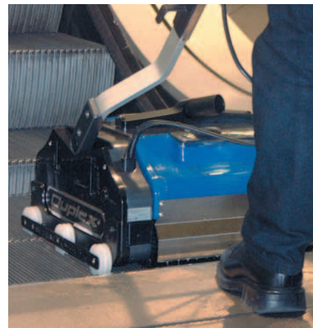
Escalator kit in action