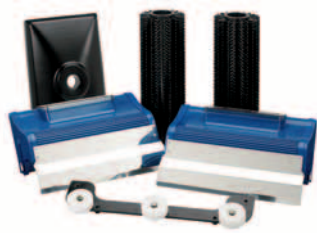
Optional escalator kit for the DP 420