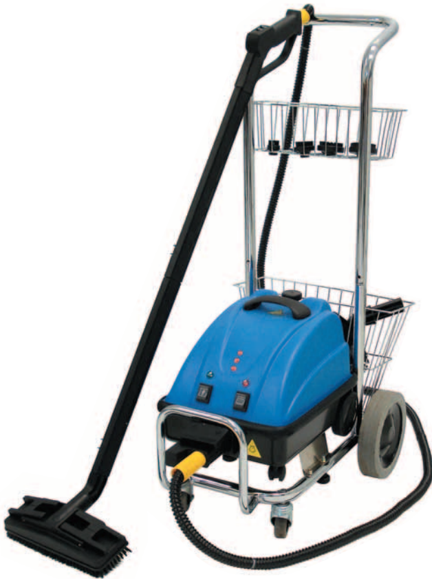
Jet Steam 1600C in CR 40025 cart

It will even kill dust mites on a hotel mattress.