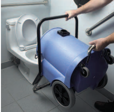
The unique tip and pour system allows the tank to be emptied even in the absence of a floor drain.