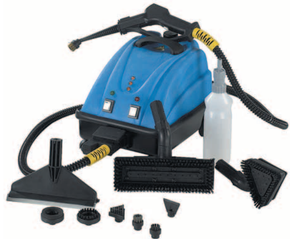
Jet Steam 1600C